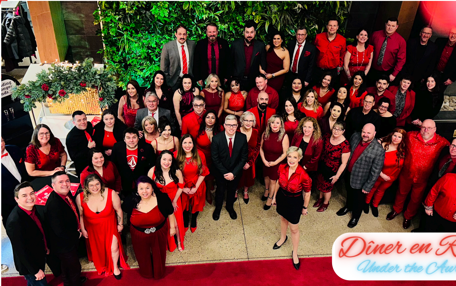
Diner en Rouge Under the Aw